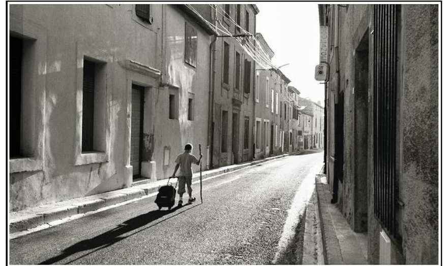
France - Boy Walking 2006